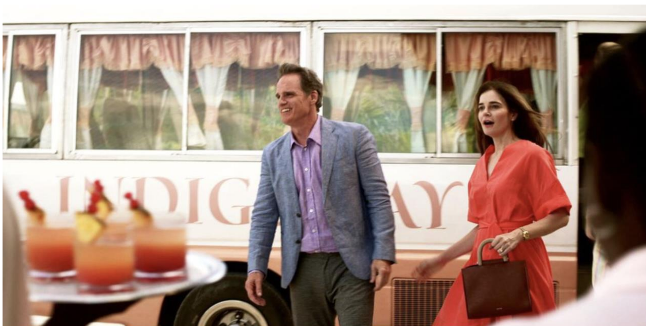
Michael Park and Betsy Brandt.